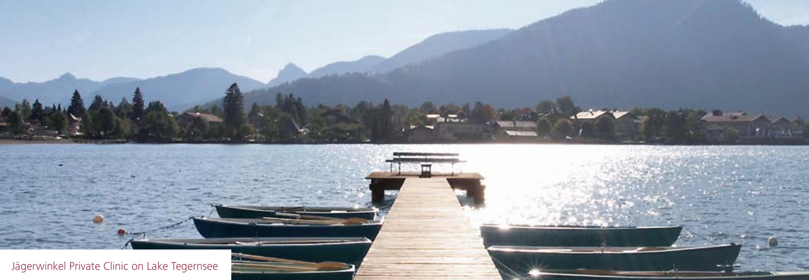
Jägerwinkel Private Clinic on Lake Tegernsee